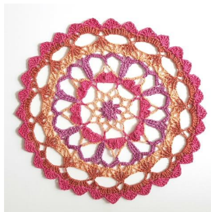
Colours used: Bordeaux, Sunkissed Coral, Sweet Pea & Sahara