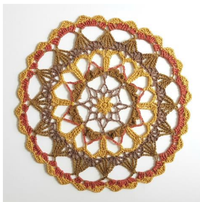
Colours used: Old Gold, Pecan, Sahara & Patina