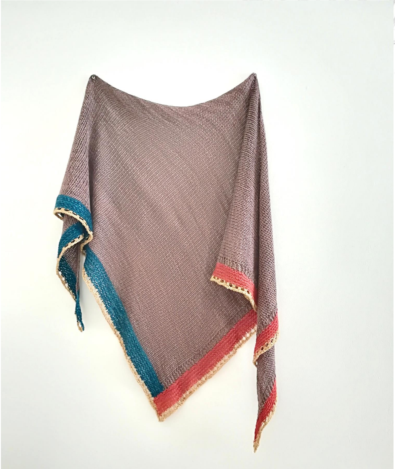
Colours used: Pecan, Baltic, Sahara & Old Gold Designed by Carle Dehning for Nurturing Fibres